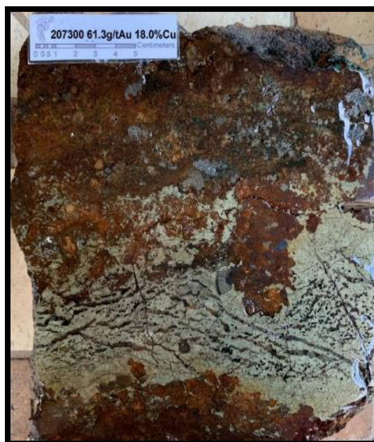
Photos: Left- Initiating the extension trench at Leah's Lode. Right- Polished outcrop sample of garnet-chalcopyrite skarn grading 61.3g/t Au and 18% Cu 1 taken ~2m from the original Leah's Lode trench.

For the purpose of ASX Listing Rule 15.5, the Board has authorised this announcement to be released.